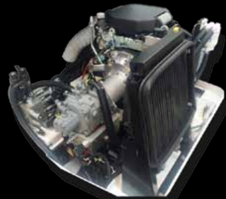
Transom mounted Honda 22hp in-board air-cooled engine.