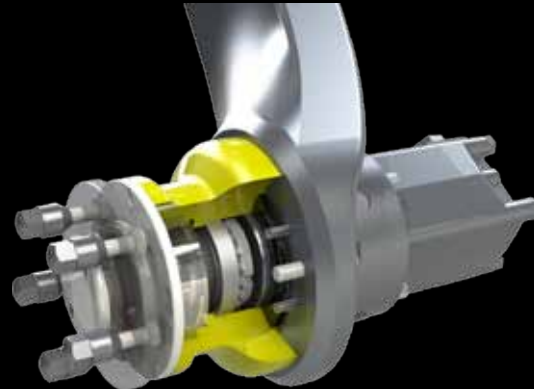
In-hub 315cc hydraulic wheel motor with internal mechanical safety break and proprietary submersible bearing hub. Max 900 Nm per wheel.